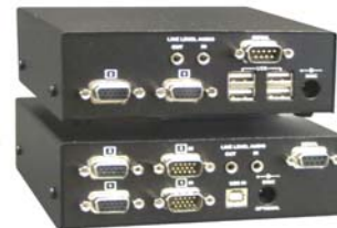
Dual Video w/serial-audio

Rear View of All CrystalView Mini USB Models