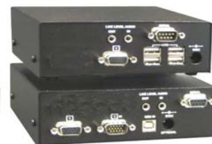
Single Video w/serial-audio