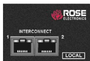
Uses standard CATx cable up to 150 feet

The Serial/Audio model allows stereo audio to be transmitted in either direction across the CATx link simultaneously. Many serial devices like a Touchscreen can plug directly into the serial port on the Remote Unit. The Mini model is small in size but loaded with state of the art technology. It is ideal for extending the distance between a CPU and a KVM station up to 150 feet.