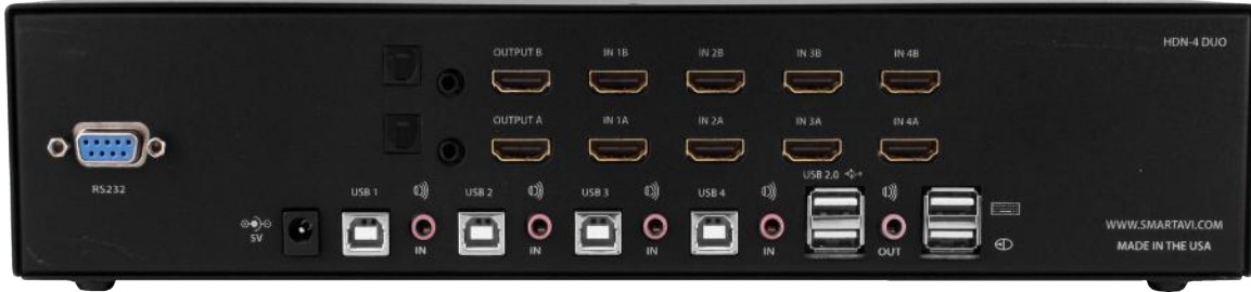
HDN-4 DUO Rear