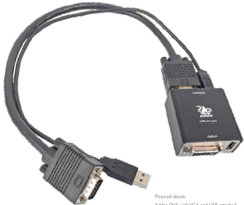
Pictured above: Adder DVA with VGA and USB attached

1 x Adder DVA module 1 x 41cm VGA cable (male to male) 1 x 45cm USB A to B cable