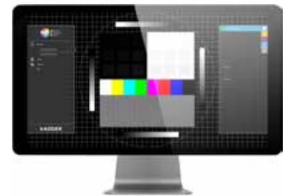
Pictured above: Adder DVA calibration software as part of the Virtual Control App

Adder DVA is supplied with a Virtual Control Panel (VCP) app which allows brightness, tone and sharpness to be adjusted. Vertical and horizontal video alignment can also be adjusted, where necessary. The VCP app contains a test pattern to accurately display the changes. EDID management options can also be changed and the EDID's of the monitors can be displayed.