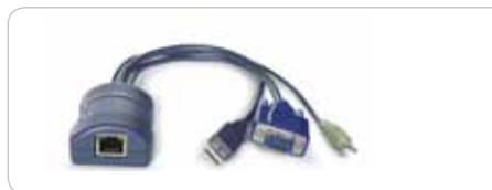
Example CAM: CATX-USB-A

Master Power Switch for connection to AdderView CATx IP or standalone Ethernet operation: PSU-8MASTER