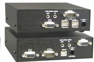
Single Video w/serial-audio