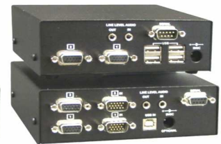
Dual Video w/serial-audio

■ Phone: 281-933-7673 ■ E-mail: sales@rose.com ■