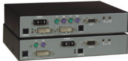
DUAL PC MODEL WITH SERIAL AND AUDIO

The transmitter and receiver are Class 1 laser products. The MultiMode transceivers comply with IEC825-1 and FD 21 CFR 1040.10 and 1040.1.1.