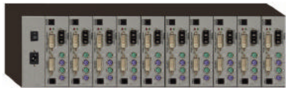
DUAL PC MODEL / 10 UNIT RACK