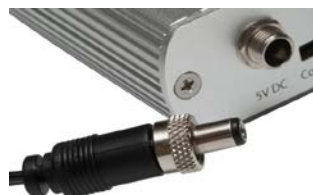
Locking Power Connector