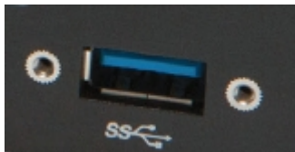
Locking USB Connector

Fiber optic cable should be either OM2 (50/125µm) for non-camera applications at 50 metres, or OM3 (50/125µm) for USB3.0 camera operation at 100 metres.