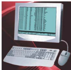
VT220 terminal mode

Local monitor connection, security, flash memory, system status and many other features ensure that the UltraConsole will streamline your data center or server room and provide a central access point for your system.