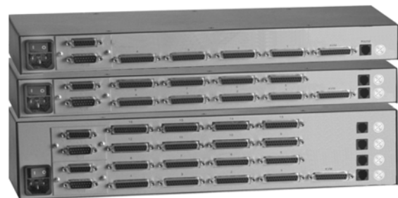
Rear view - UC1 1x4, 1x8, 1x16

■ Phone: 281-933-7673 ■ E-mail: sales@rose.com ■