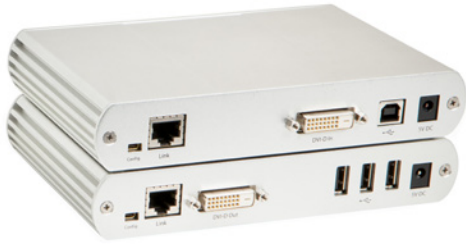
Rear views of LEX (top) and REX (bottom)