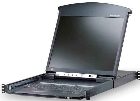
● KL1516Ai Front view