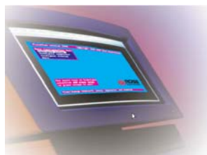
UltraView Remote on-screen menu

With its ability to access your computers and servers locally or over IP, its advanced on-screen menu system, built-in security, flash memory, easy expansion, and other features, you start to get a sense of the advantages and applications that the UltraView Remote 2 can provide.