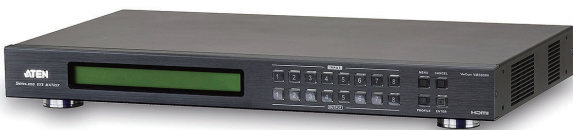
VM5808H Front view