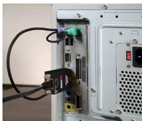
Direct connect CAT5 Transmitter streamlines your installation

Europe and Asia, Rose provides a full range of capabilities and support. Call us today for more information about this and other Rose products.